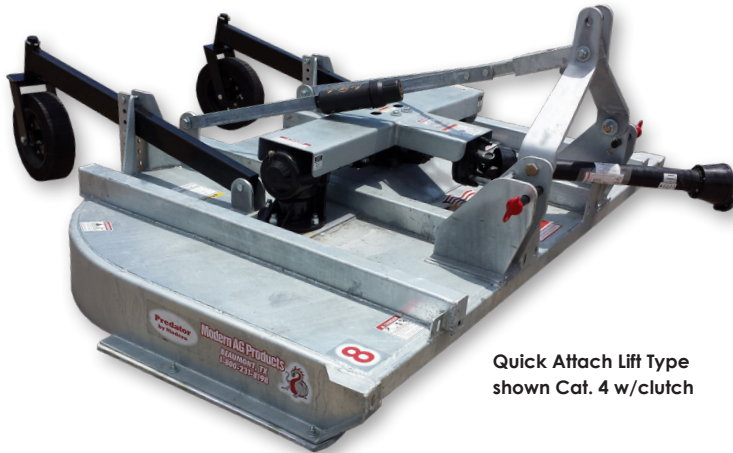
Quick Attach Lift Type shown Cat. 4 w/clutch