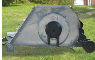
Smooth underdecks make for more efficient mowing and less area for rust to begin. Deck rings are standard.