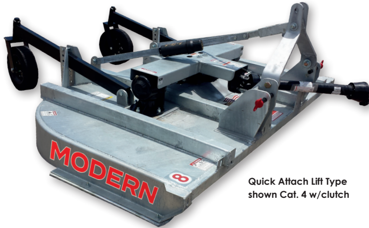
Quick Attach Lift Type shown Cat. 4 w/clutch